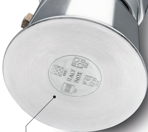
BOTTOM STAINLESS STEEL (AISI 430) Allows for use on any type of cooking surface.