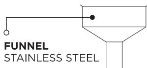
FUNNEL STAINLESS STEEL